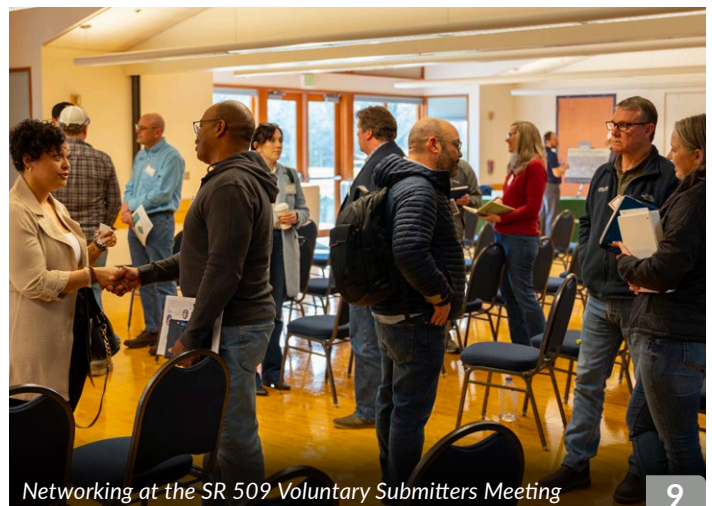
Networking at the SR 509 Voluntary Submitters Meeting

SR 509, 24th Avenue South to South 188th Street New Expressway Project: On July 21, WSDOT announced the short list for proposal development for this $400-500 million design-build contract with 15% design and 22% construction federal DBE participation requirements. During the proposal development phase, which kicked off July 27, WSDOT is working with the shortlisted proposer, Atkinson Construction, to identify and promote opportunities to network with DBE firms interested in subcontracting on this project