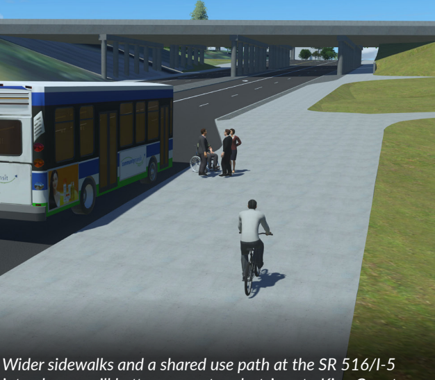
interchange will better connect pedestrians to King County Metro and Link light rail.

All sidewalks and shareduse paths built or improved within these projects are compliant with the Americans with Disabilities Act and WSDOT's commitment to serving community needs with all modes of travel in mind. Both projects focus on regional connections, creating safer routes and access for all community members, including those who use adaptive devices and other methods of travel.